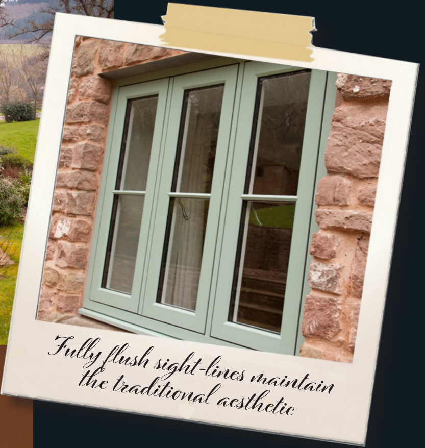
Fully flush sight-lines maintain the traditional aesthetic