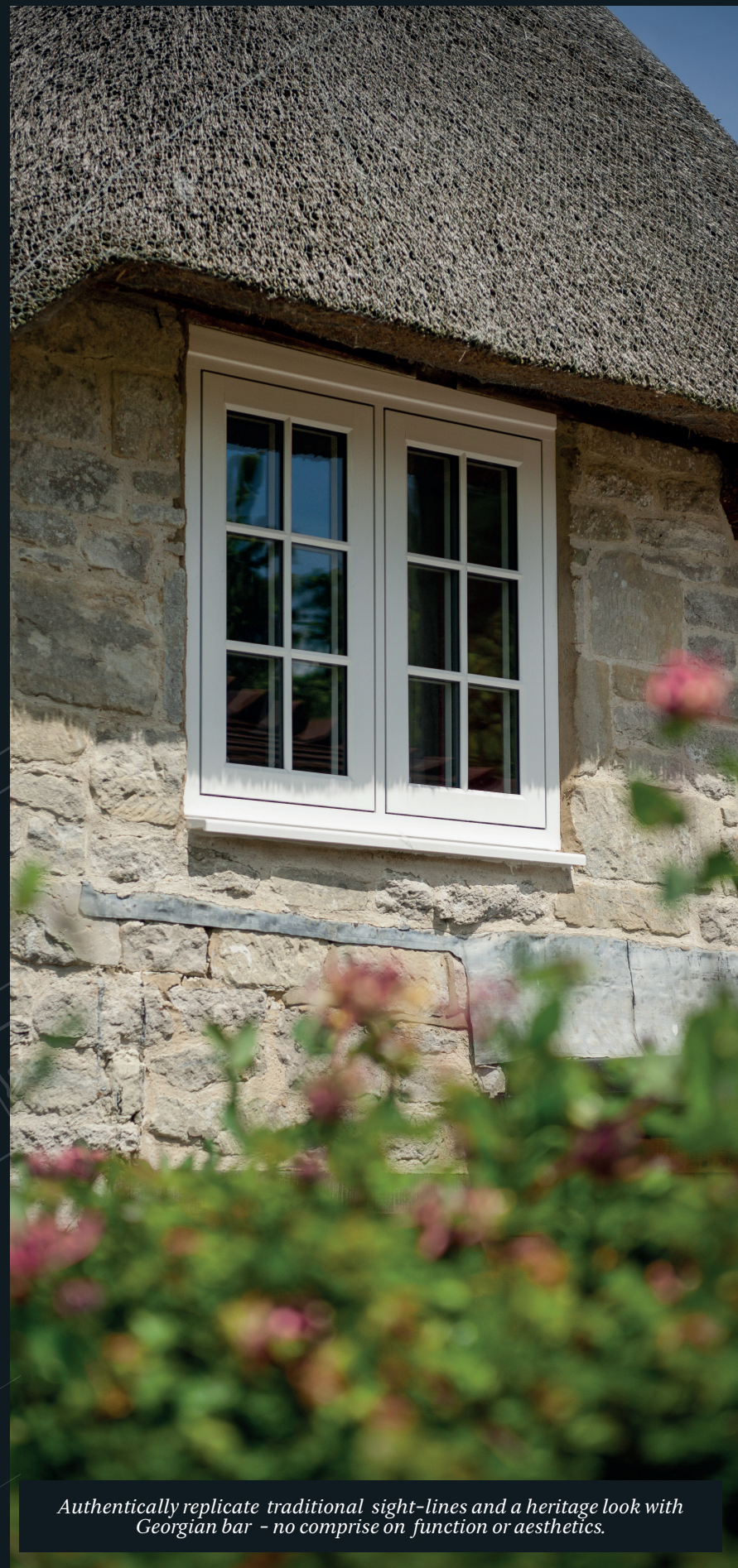
Authentically replicate traditional sight-lines and a heritage look with Georgian bar - no compromise on function or aesthetics.

For most homeowners, the style of their property will inform the design choices they make, so if you live in a Conservation Area Residence 9 can help enhance both appearance and performance, we have proven experience in helping to restore the original character of properties in hundreds of Conservation Areas, always with an eye to any planning considerations. We have also been approved in a number of Grade II Listed properties. If you are in a location with more design freedom R9 can help bring your ideas to life, balancing design and practicality to enhance your home, whilst still maintaining traditional looks.