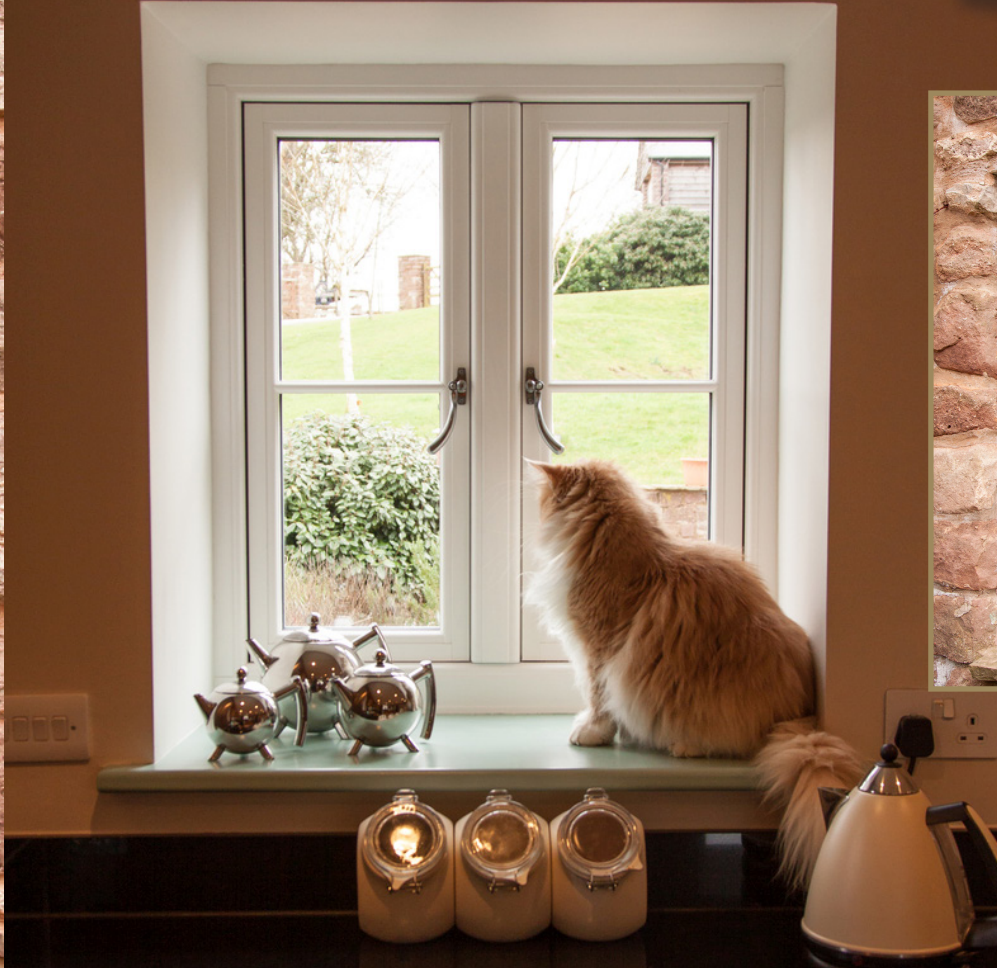
Beautiful low maintenance timber alternative